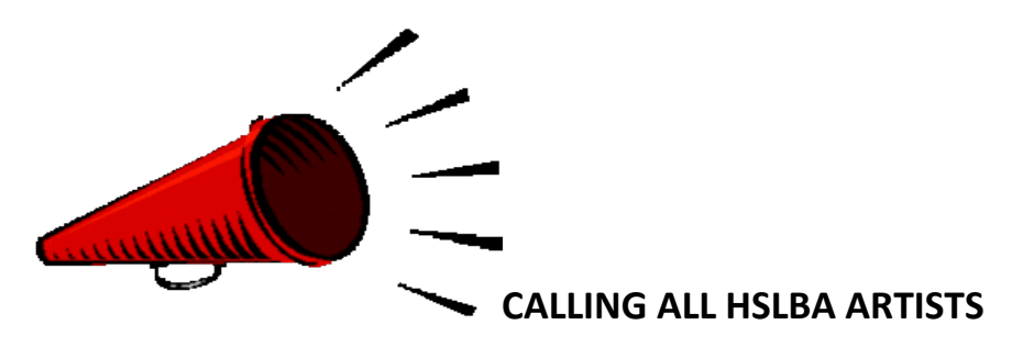
Exhibit at the HSLBA "Day by the Bay" Home Tour -