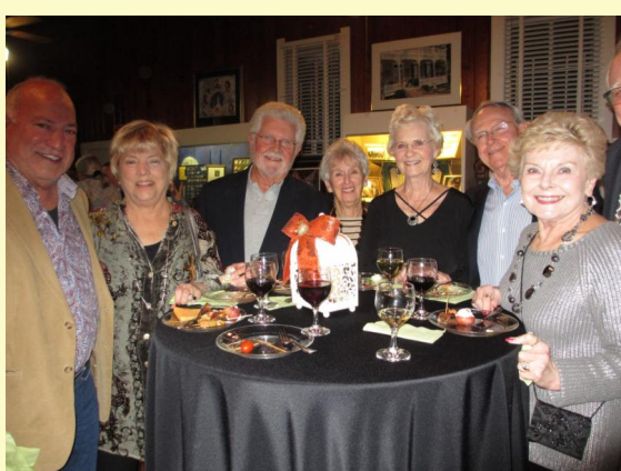
Every October the HSLBA teams with the Bay Area Museum Guild for a wonderful event called Music at the Museum. Fabulous food, wine and music always make for a magical evening at the Bay Area Museum.